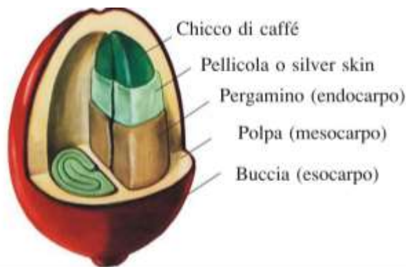
Fig. 2 – Structure of a coffee drupe

Once fully ripe, the coffee berries are harvested and processed on the plantation to separate the coffee seed from the outer skin. Subsequently the seeds are transported on ships and by road to the company, where they are subjected to a flow of hot air for the removal of the parchment. Roasting is the final process reserved for coffee beans capable of transforming the raw bean, which tends to be tasteless, into the toasted bean.