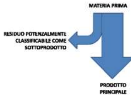
Fig. 1 – By-product production scheme

The Ministry of the Environment issued, with Ministerial Decree no. 264 of 13/10/2016, the Regulation containing the indicative criteria to facilitate the demonstration of the existence of the requirements for the qualification of production residues as by-products and not as waste.